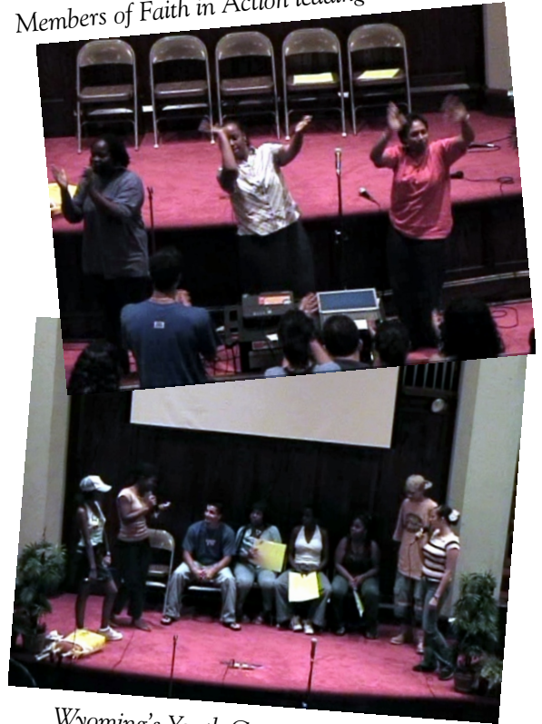
Wyoming's Youth Group performing a skit.

some people think about how they leave their faith and religion at church and don't take it with them outside of the church's walls. About 20+ teens went up front and accepted Jesus as their savior that night. I wish we could do these kind of rallies and things more often, and next time I'm making sure a friend comes with me!